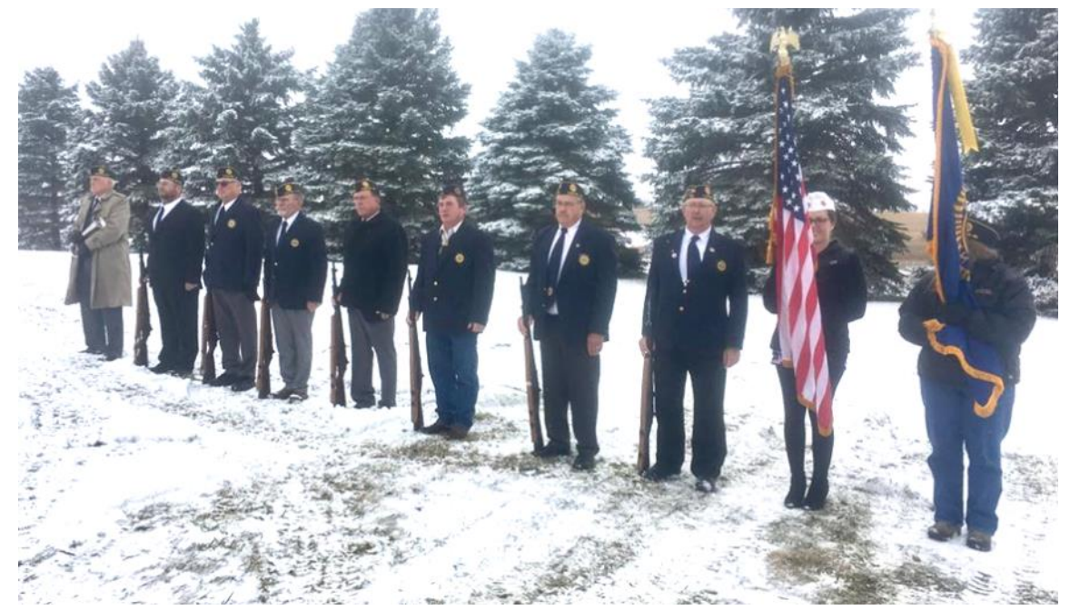
Above: Members of Chester Post #136 provide funeral honors for a local veteran