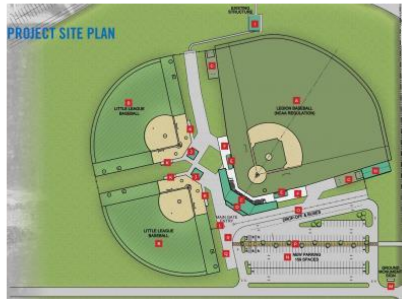
Proposed Milbank American Legion Baseball Facility

those unfamiliar, the For American Legion Baseball league was first proposed at an American Legion state convention in Milbank, South Dakota. More than 90 years later, American Legion Baseball continues to be an investment in America's youth. It enjoys a reputation as one of the most successful and tradition-rich amateur athletic leagues and today, the program registers teams in all 50 states plus Canada. Since its inception in 1925, countless Legion Baseball players have gone on to play college and professional baseball, with 68 inducted into the Baseball Hall of