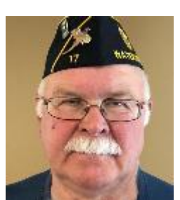
loss of $6,507so far.