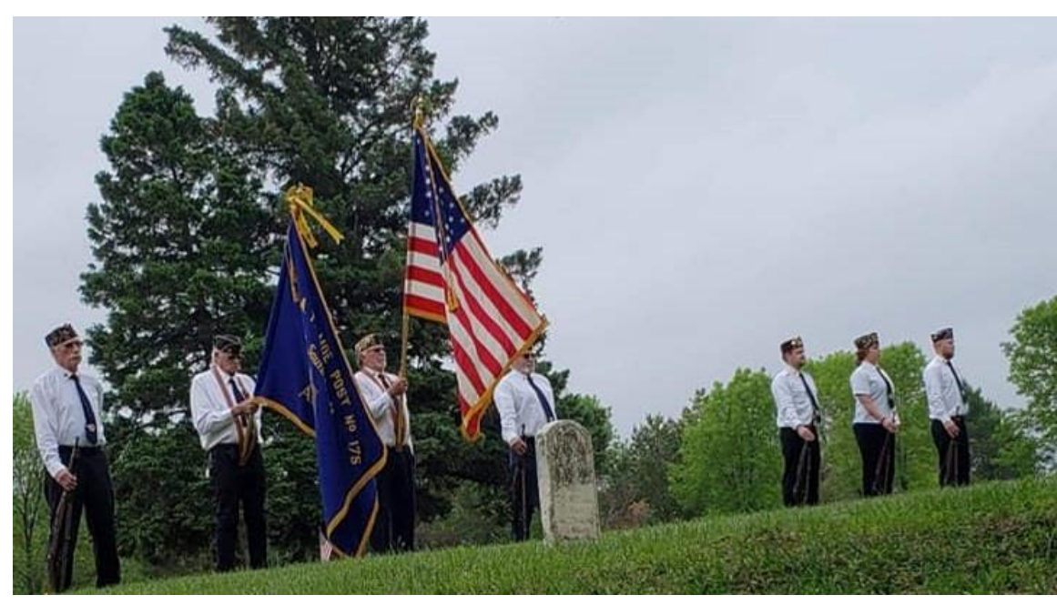
On Memorial Day, members of the Joseph A. T. Moe Post #175 performed services at Baltic Cemetery, Pioneer Cemetery, West Niadros Cemetery and East Niadros Cemetery. —Submitted by Post #175