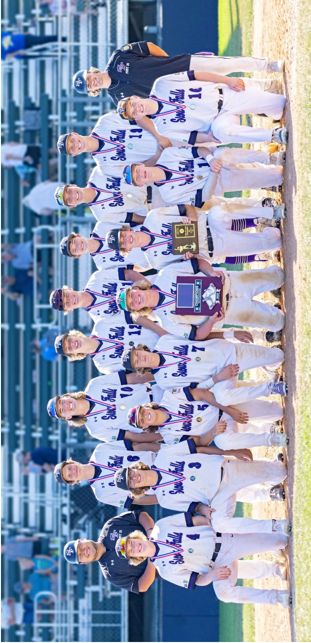
2022 CLASS "A" JR STATE CHAMPIONS Sioux Falls East Post 15